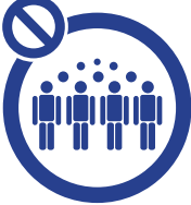
Avoid Large Crowds