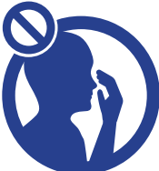
Do Not Touch Your Face esp. Mouth, Eyes, Nose