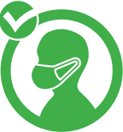
Use Face Mask or Respirator