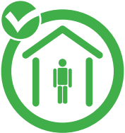
Stay at Home if Possible