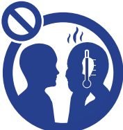
Do Not Meet Infected or Sick People