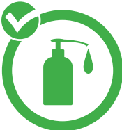
Use Soap or Hand Sanitizer