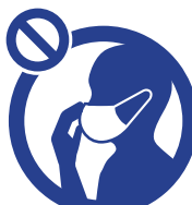
Do Not Touch The Front Part of a Mask