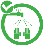
Wash Hands Thoroughly